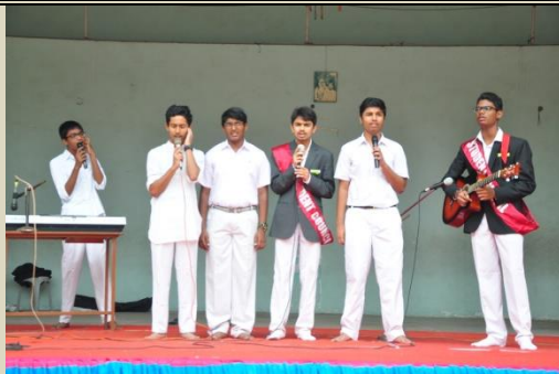
Vidyalaya students with their own musical composition

Six students of Class X, formed their own band, writing their own lyrics, composing their own music and showcasing these patriotic noble thoughts in front of the audience on Independence day. A telugu patriotic song and a hindi skit on “Matadaan ka mahatva- the impotence of casting your vote” was showcased to the audience.