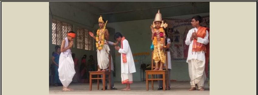
The great poet/singers- Tyagaraja, Ramadasu and Annamayya