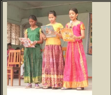
Compering children in their traditional best

Day 5 showcased the three great singers, Tyagaraja, Ramadasu and Annamayya, with their deities and melodious compositions rendered by them.