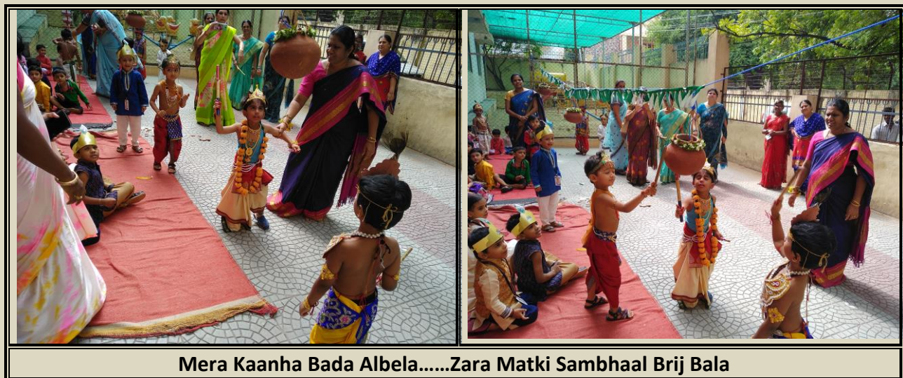
Mera Kaanha Bada Albela.....Zara Matki Sambhaal Brij Bala