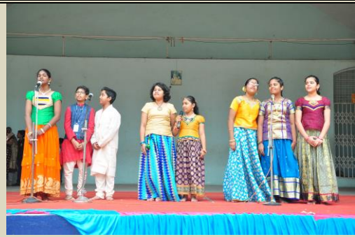
Telugu Patriotic Song