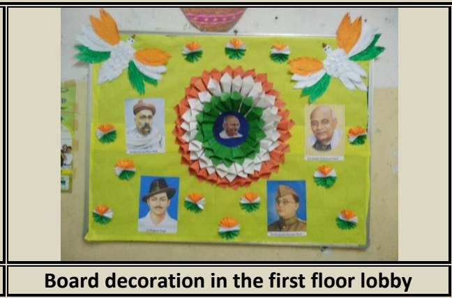
Board decoration in the first floor lobby