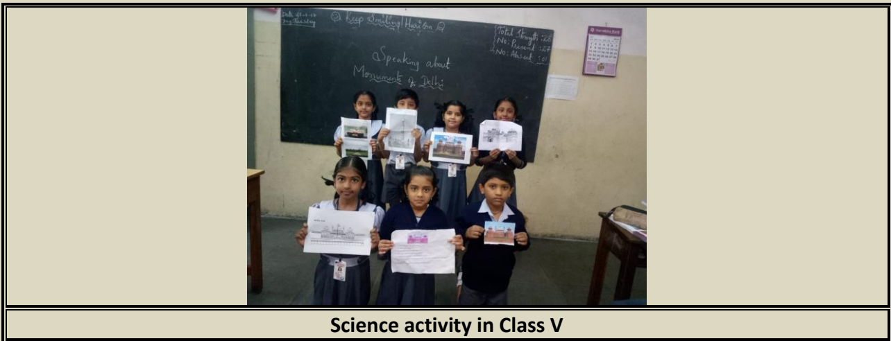
Science activity in Class V

Class III social teachers had the chapter of “Delhi” by having a short seminar on it. Children came prepared with a few charts and write ups about the monuments of Delhi.