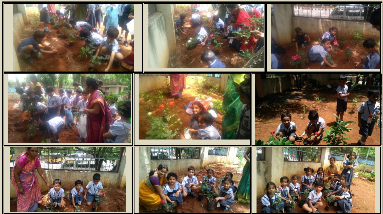
Primary children participating in Haritha Haaram as part of their CCA Activity

Children thoroughly enjoyed participating in this activity and had tremendous fun getting their hands into the natural feel of Mother Earth.