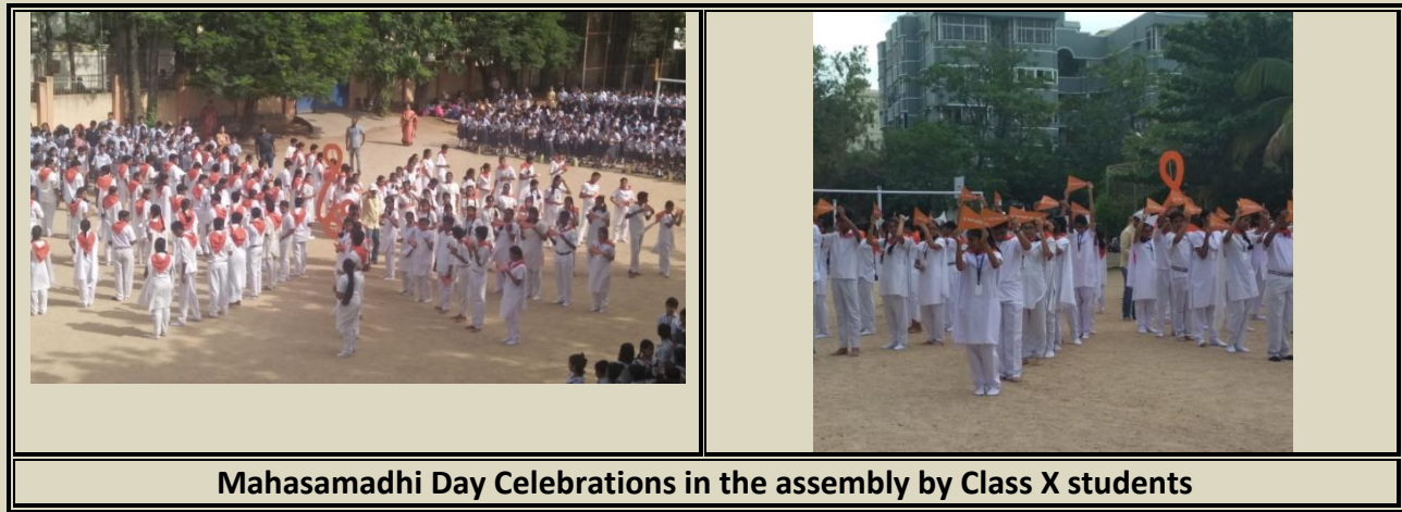
Mahasamadhi Day Celebrations in the assembly by Class X students