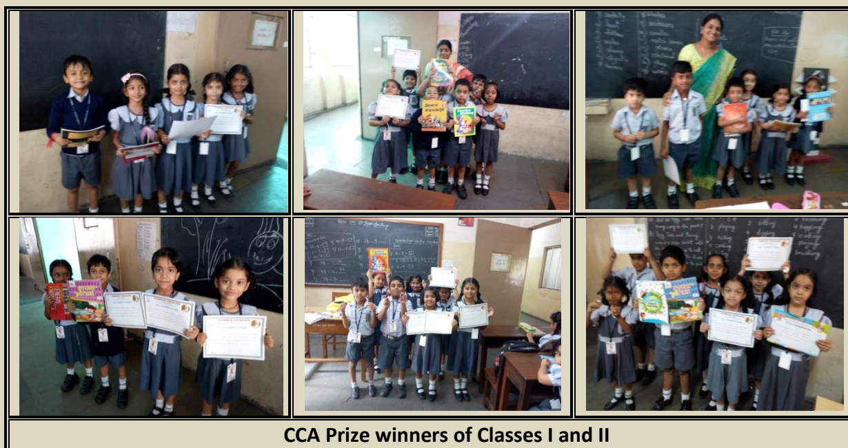
CCA Prize winners of Classes I and II