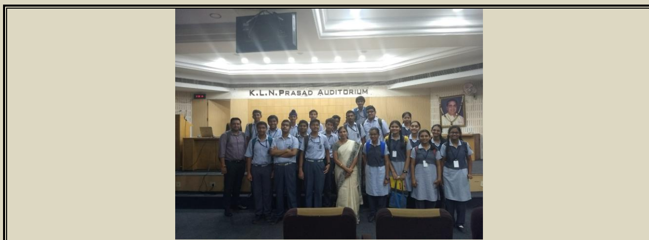
Vidyalaya students participating in ConQuiz Tador at KLN Prasad Auditorium

Congratulation to all the participants for taking part and doing their best.