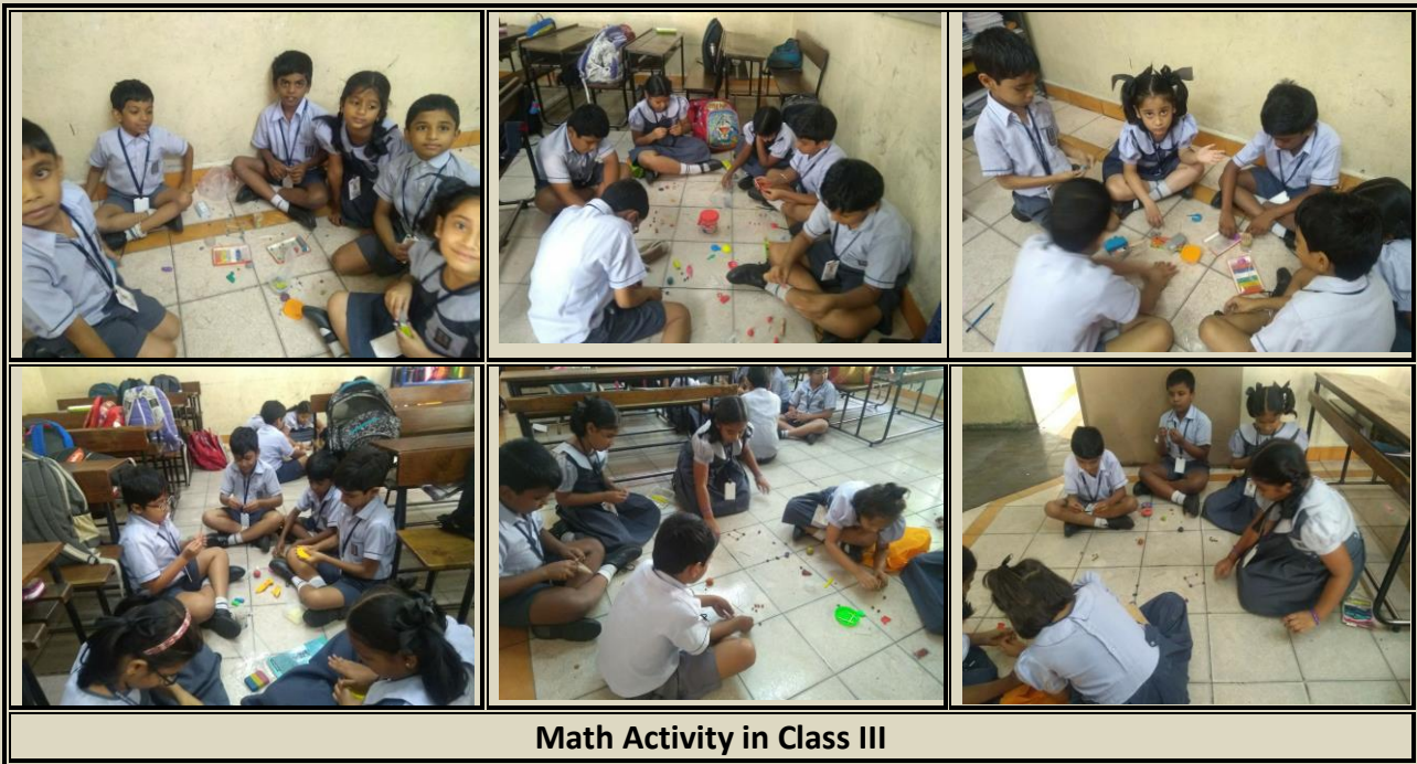
Math Activity in Class III