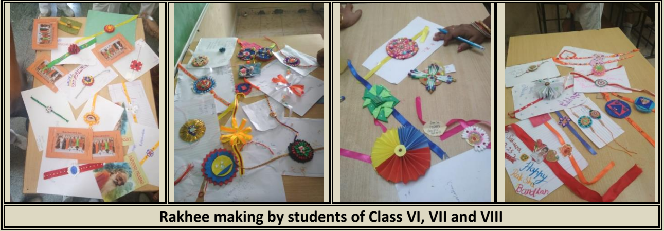
Rakhee making by students of Class VI, VII and VIII