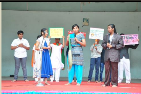
Matadaan Ka Mahatva- Be sure to cast your vote