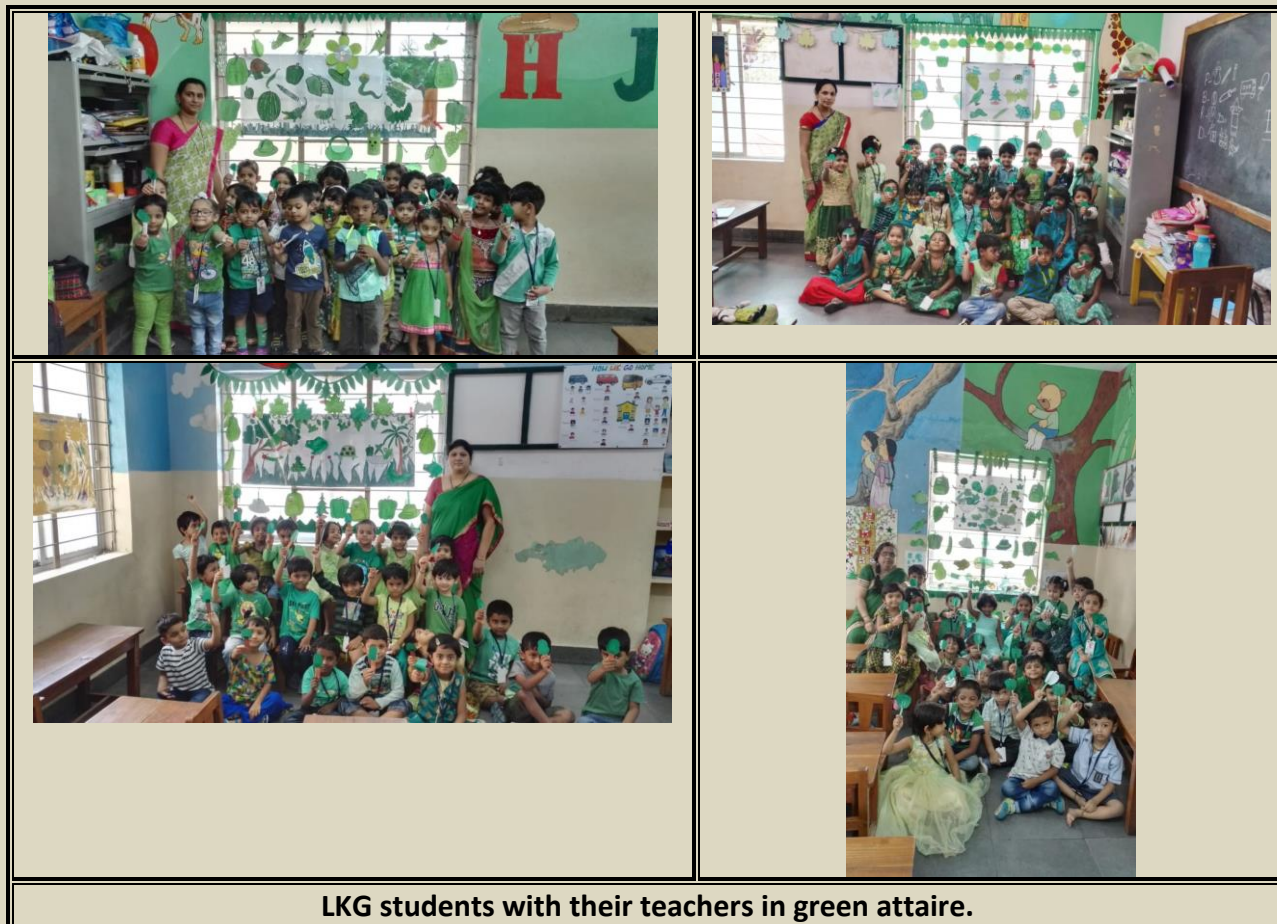
LKG students with their teachers in green attire.