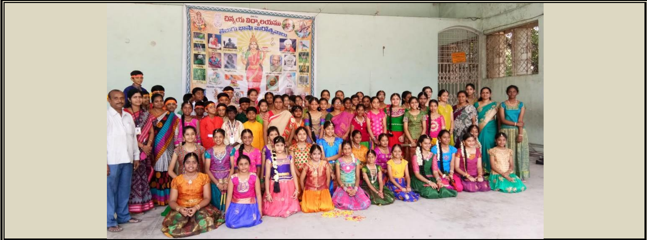
Students participating on Day 3 of Telugu Varotsavalu with their mentors.

Day 4 showed the glory of the folk songs, sung for Mother nature, the nourishers - the farmers, and the protectors- the soldiers. Sweetness of the Telugu language was showcased in a dance and song sequence.