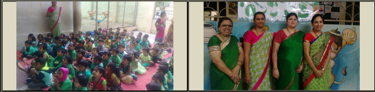
Assembly in an eco friendly environment