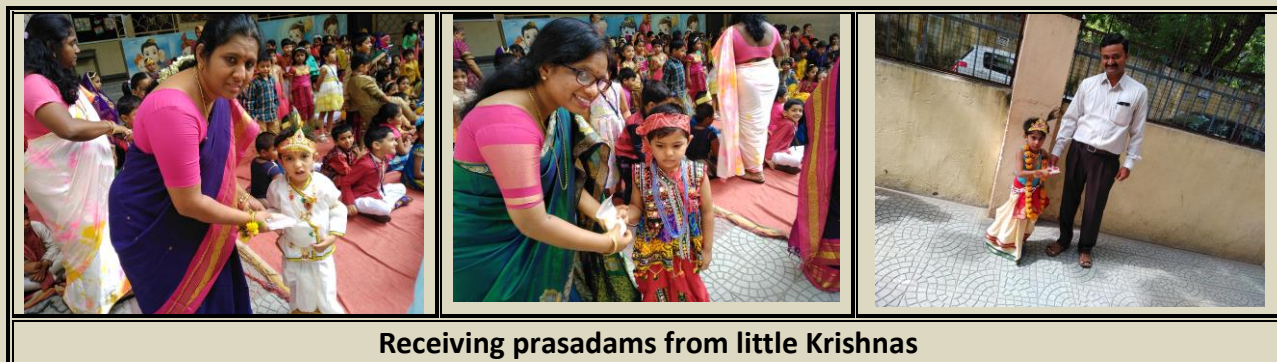
Receiving prasadam from little Krishnas