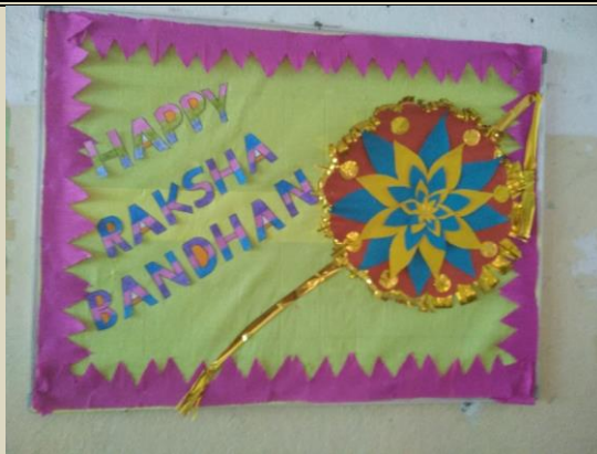
Board decoration in the first floor lobby on the occasion of Raksha Bandhan