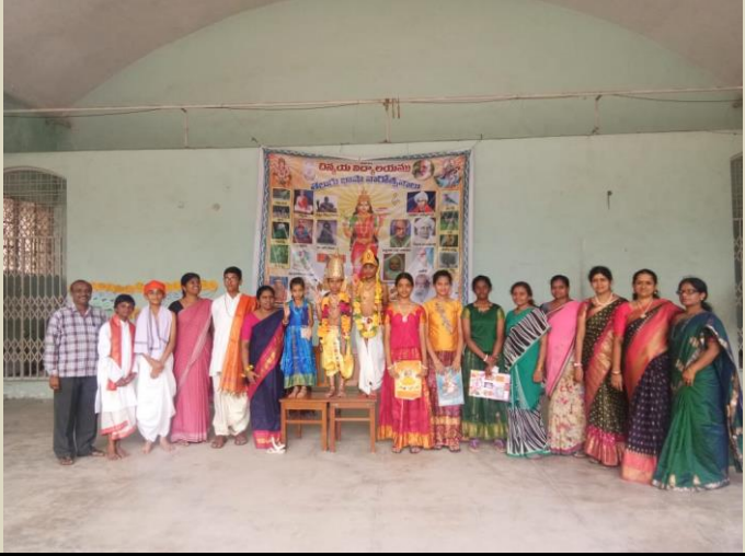
Vibrance of this great soil- Telugu teachers get blessings of the Gods!!

Day 6 of the Varotsavalu had an amazing activity to their credit, well appreciated by the audience, very well trained by the teachers and very well presented by the students.