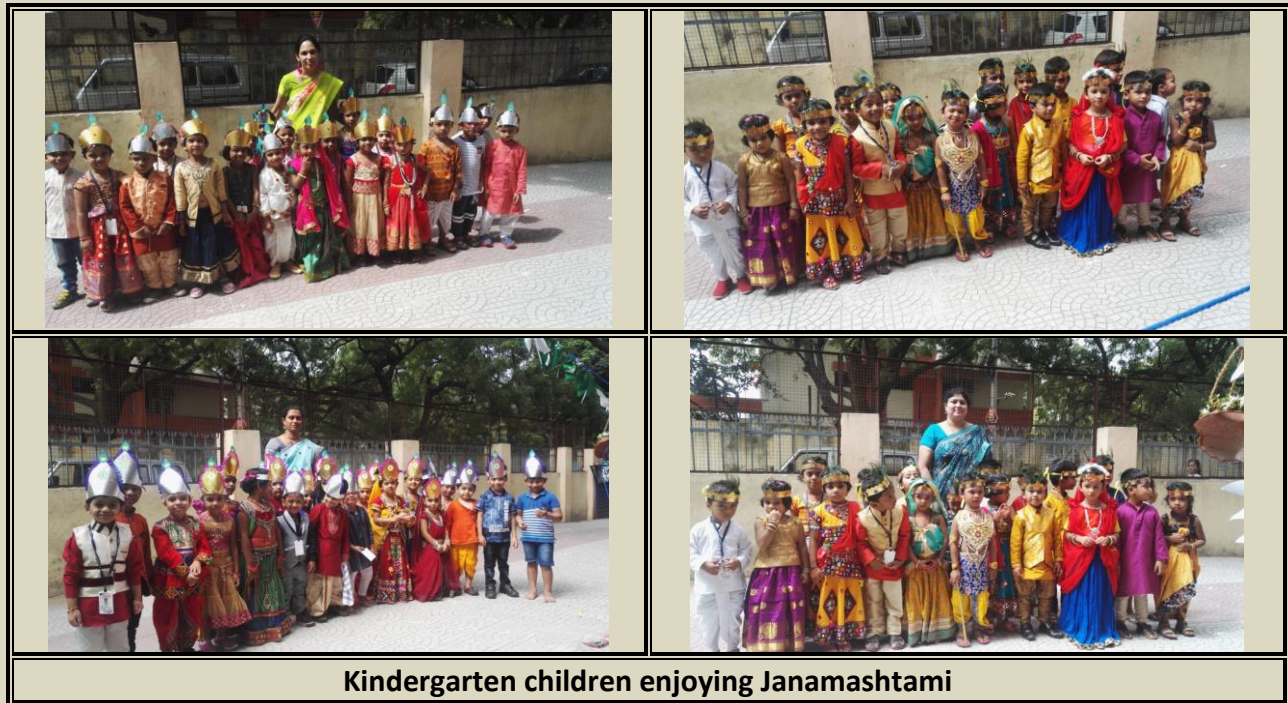
Kindergarten children enjoying Janamashtami