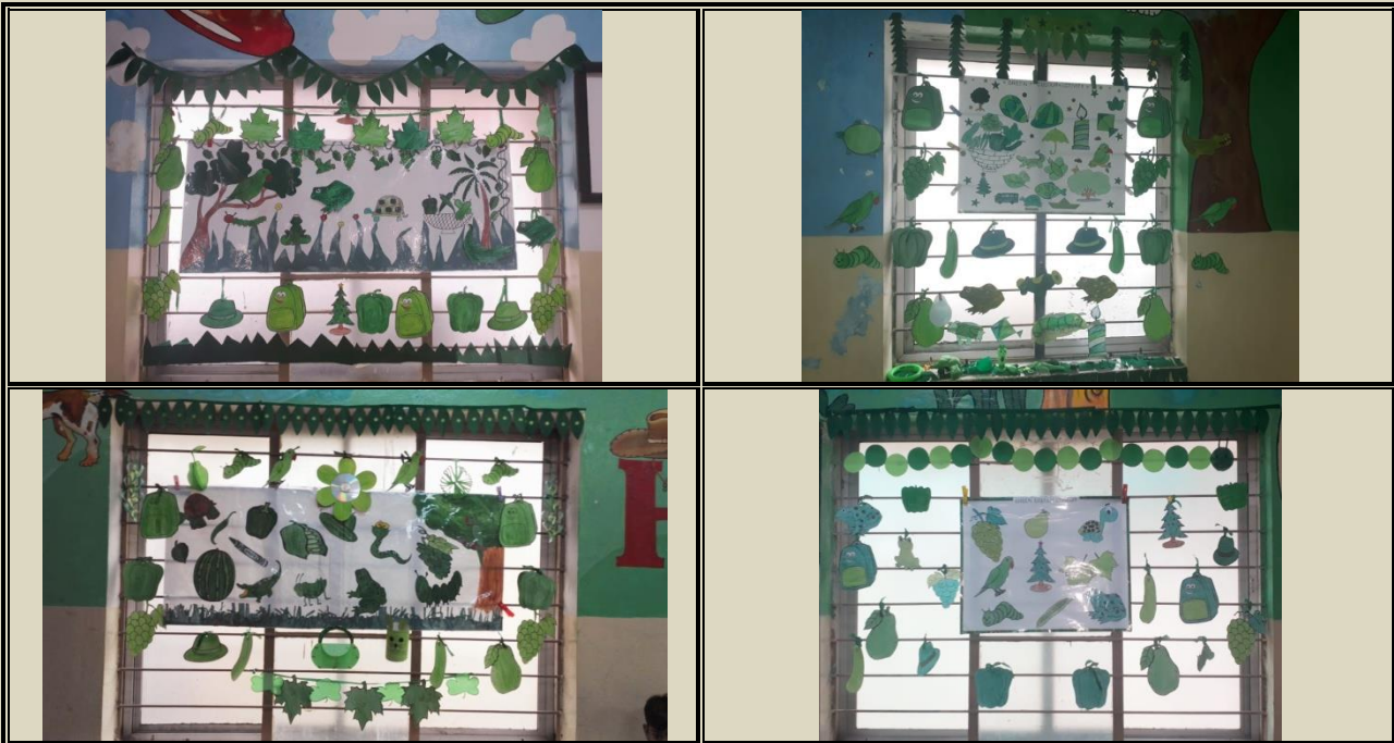
Decorations in the classrooms