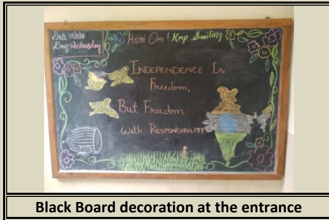
Black Board decoration at the entrance