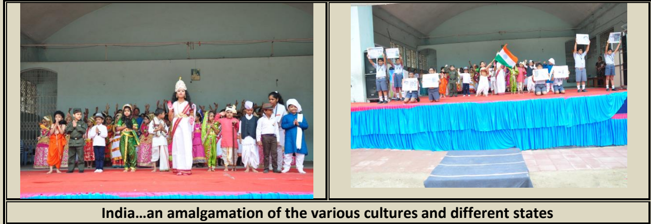
India...an amalgamation of the various cultures and different states

Little children came dressed up as great leaders of yester years and were welcomed by the audience during the grand finale.