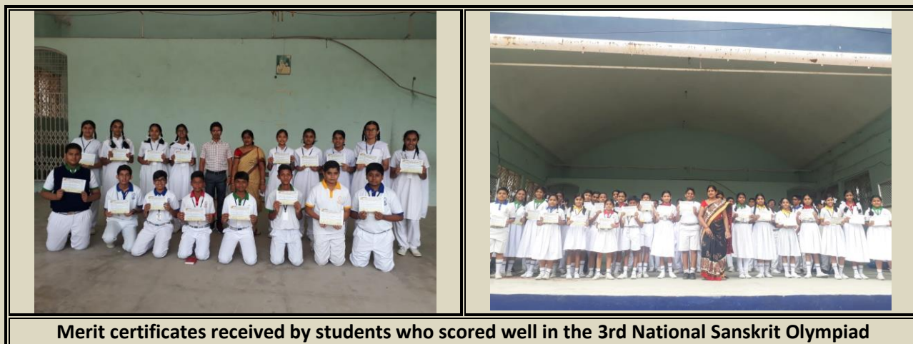
Merit certificates received by students who scored well in the 3rd National Sanskrit Olympiad

114 students from Class VI to X participated in the 3 rd National Sanskrit Olympiad held in Nov 2017. 53 of them qualified for the merit certificates, and eight of them went on to the next level, which was held in January 2018. Merit certificates were awarded to these students on the 4 th of August 2018.