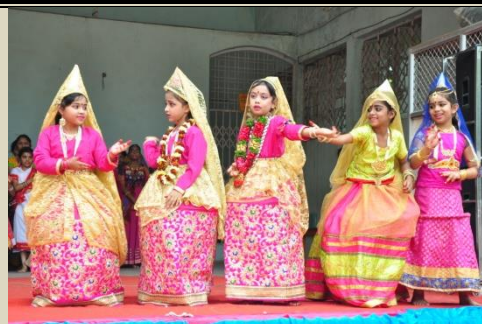
Medely of the different classical and folk dances of India