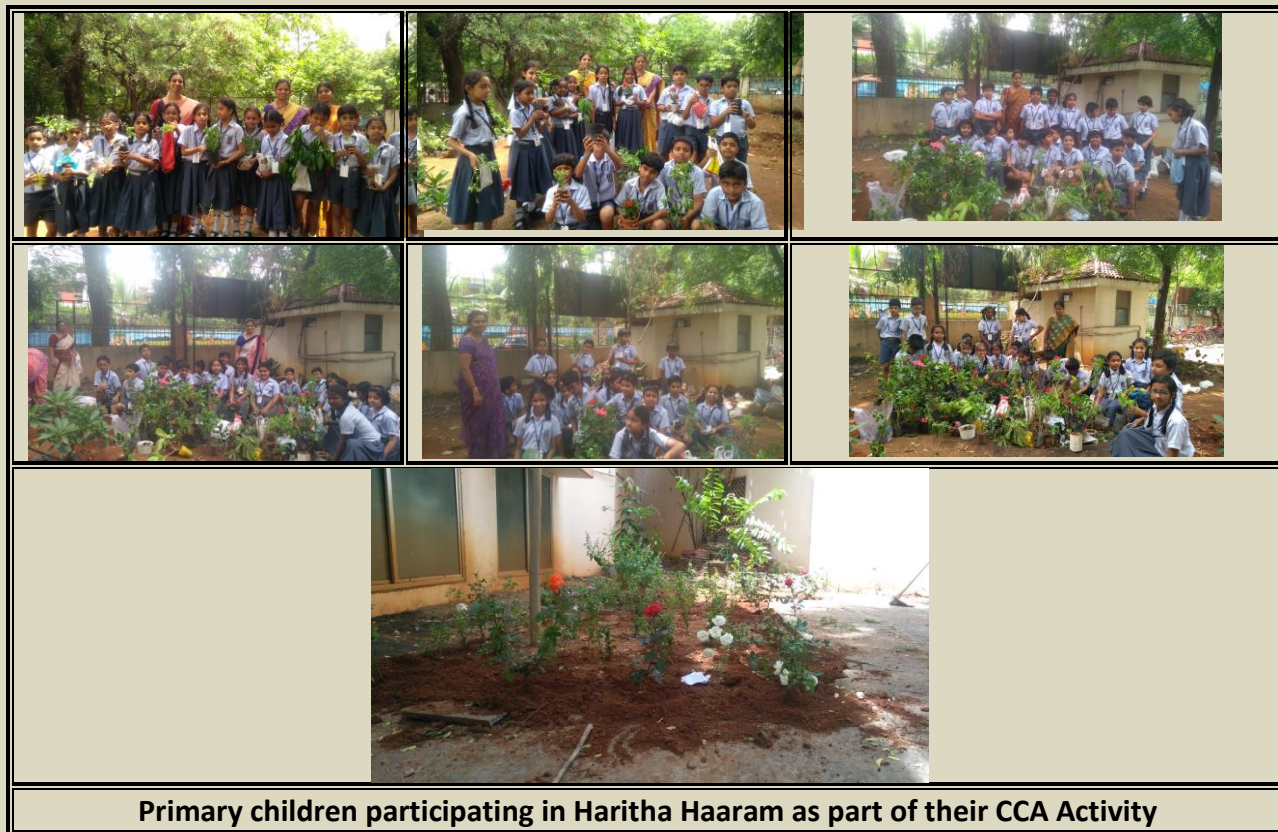
Primary children participating in Haritha Haaram as part of their CCA Activity