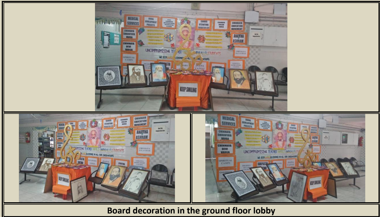
Board decoration in the ground floor lobby