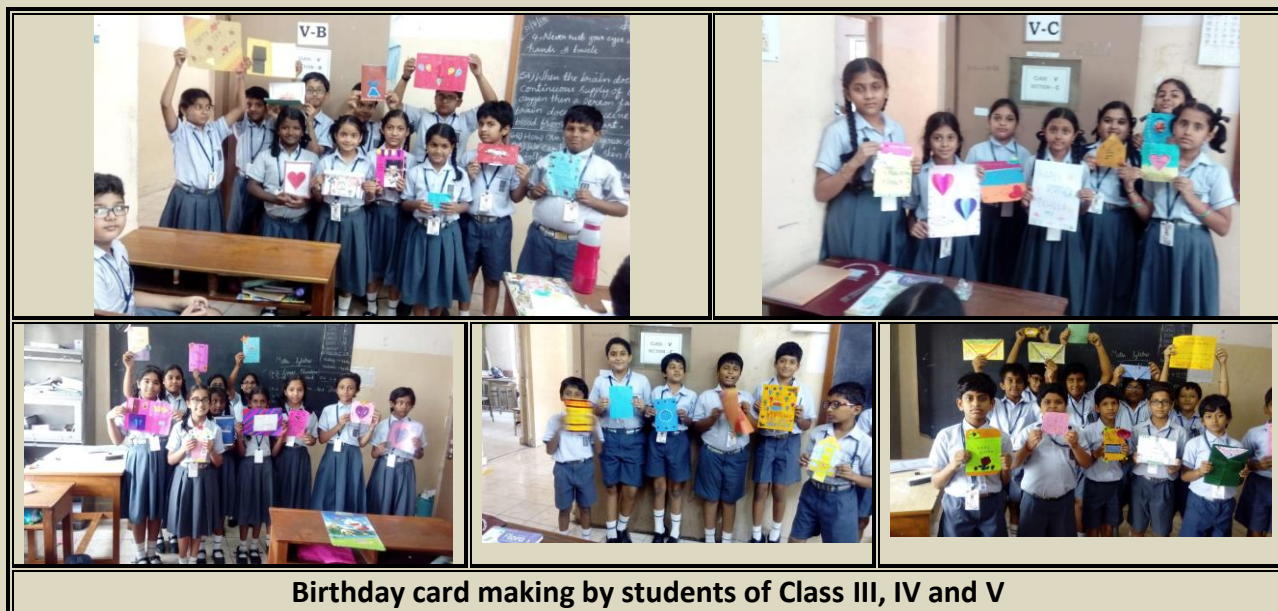
Birthday card making by students of Class III, IV and V