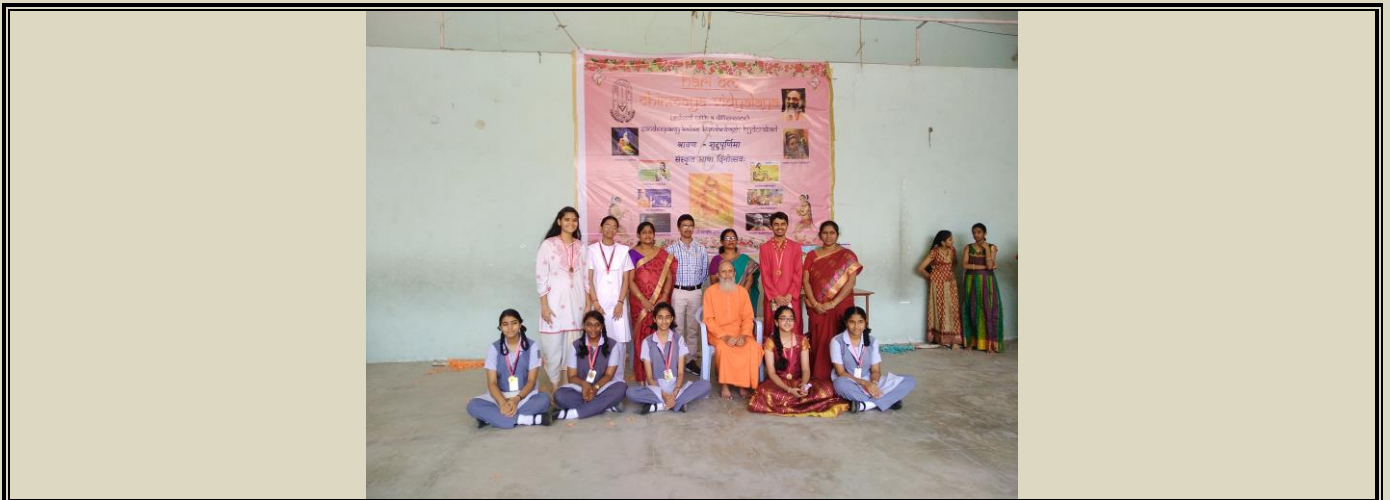
Meritorious students with Swamiji and their mentors

Children of Class VII came up with a medely of patriotic songs- each depicting a different language of our country. Children came dressed up in the colours of the tricolor, and showed their gratitude to Mother India. Children of the secondary classes rendered a Telugu patriotic song, describing the greatness of our country.