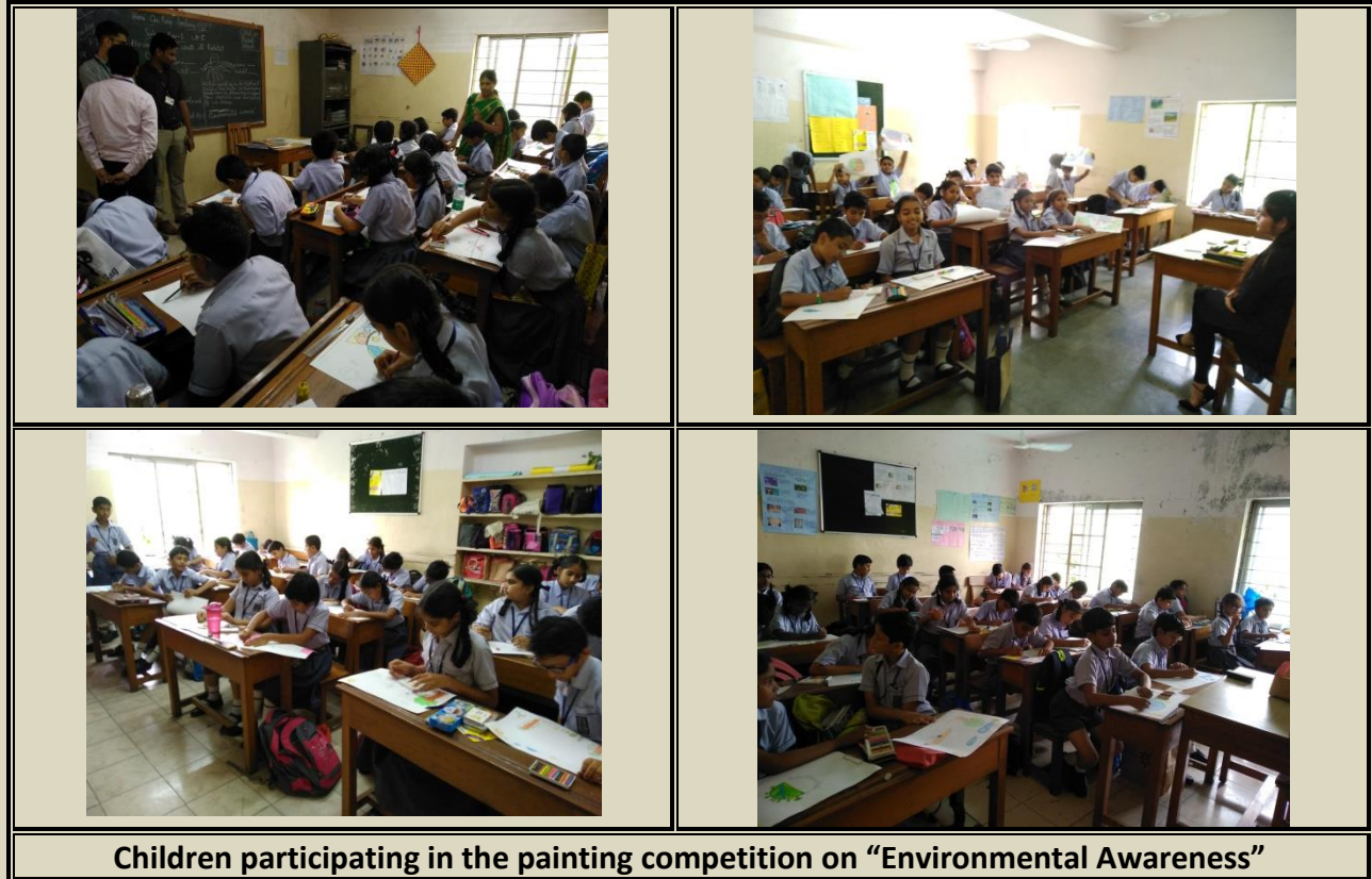
Children participating in the painting competition on “Environmental Awareness”