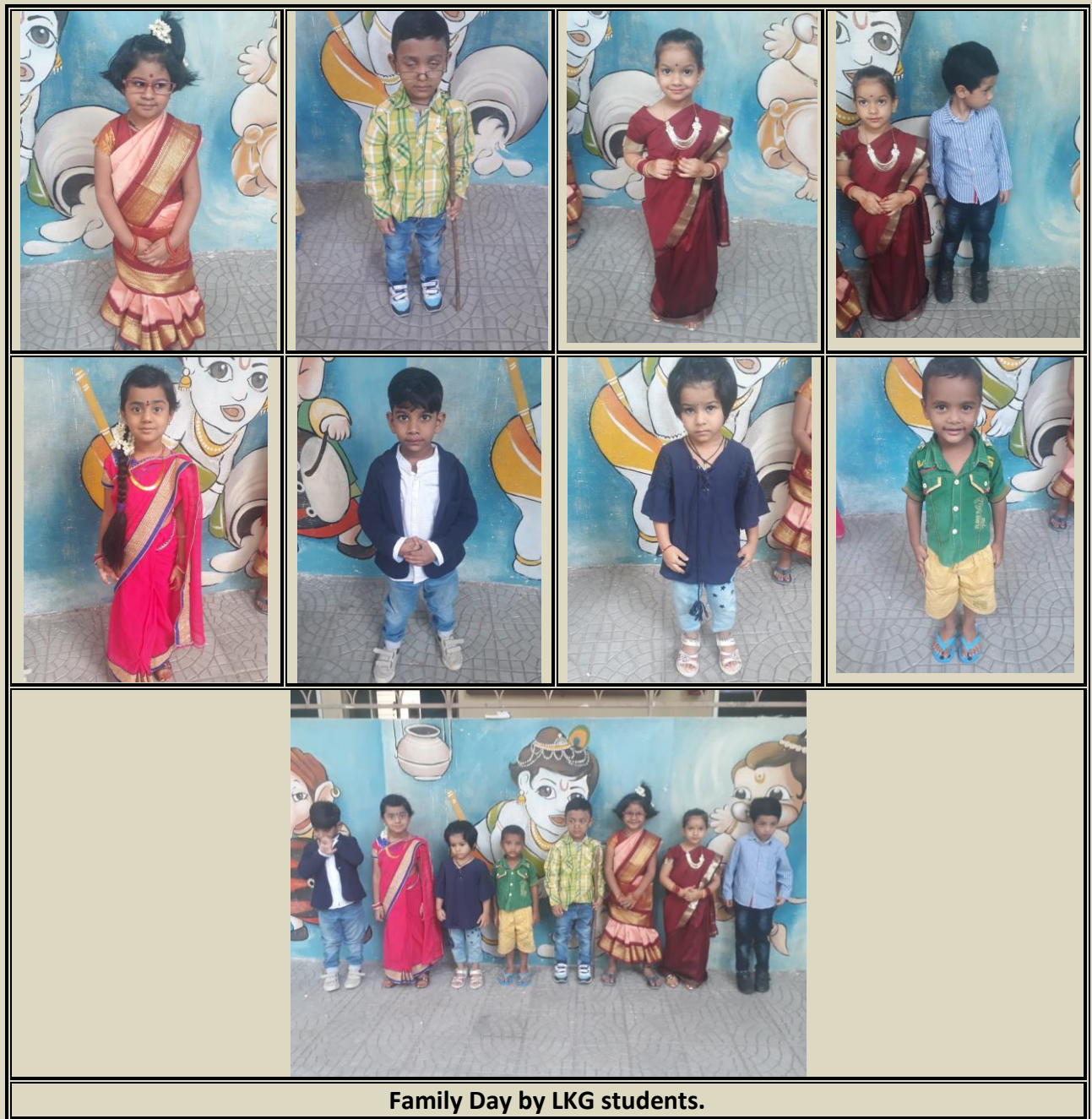
Family Day by LKG students.