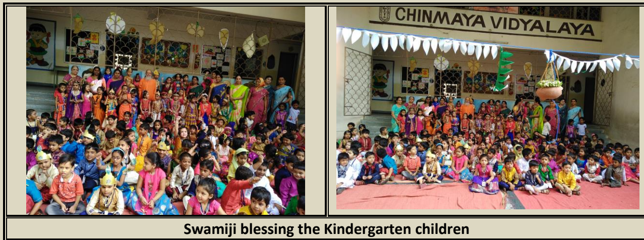
Swamiji blessing the Kindergarten children