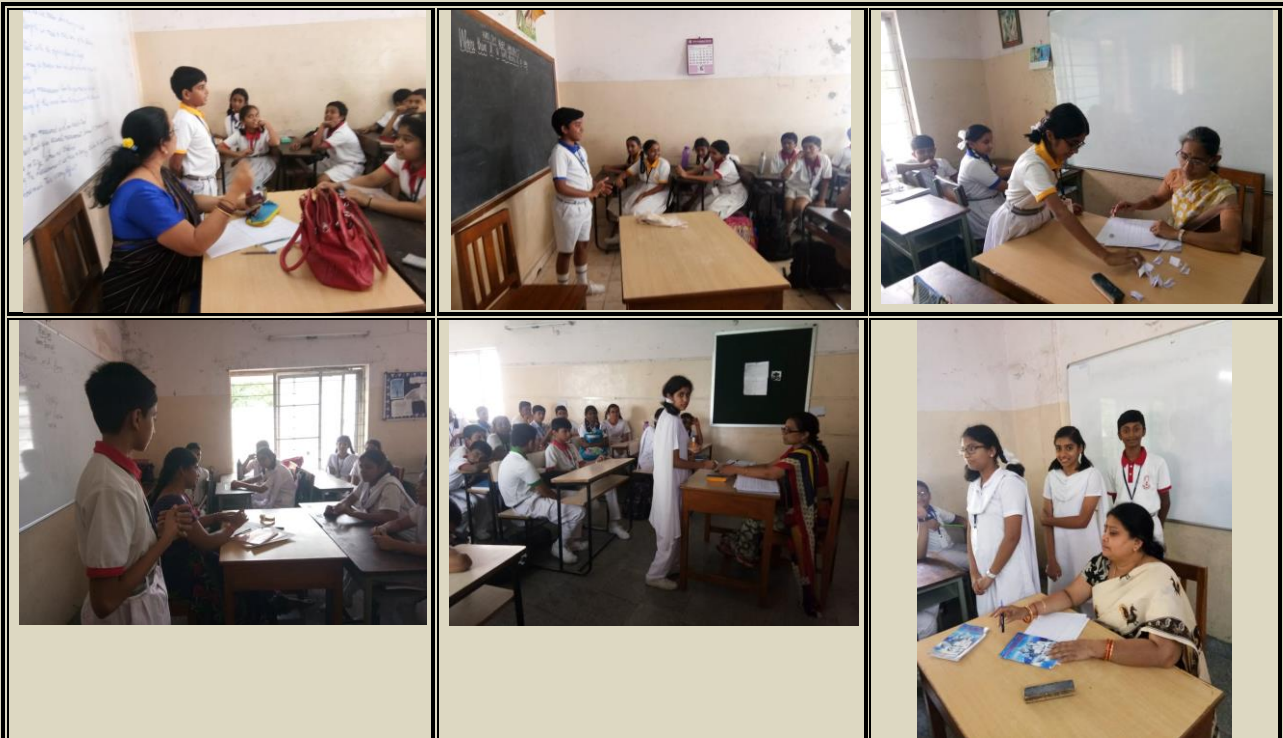
Extempore for students of Classes VI,VII and VIII