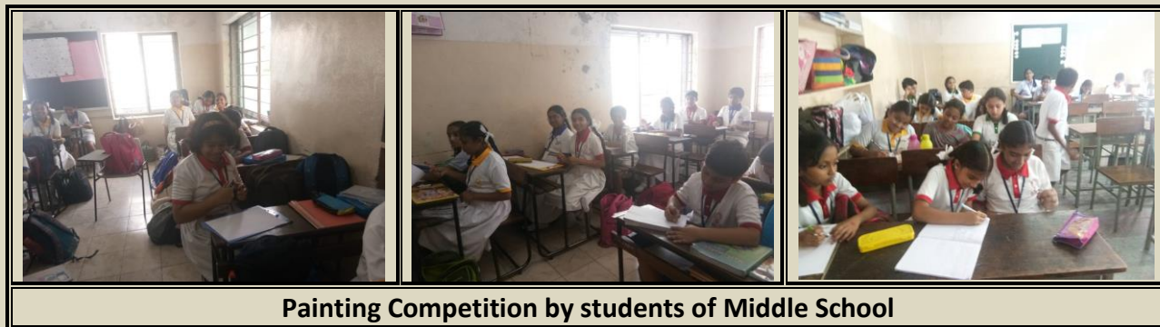
Painting Competition by students of Middle School