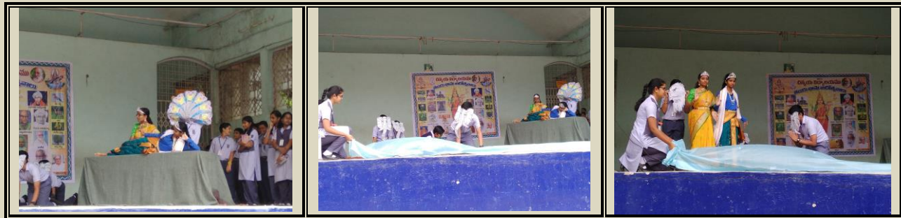
Enaction of Gajendra Moksham