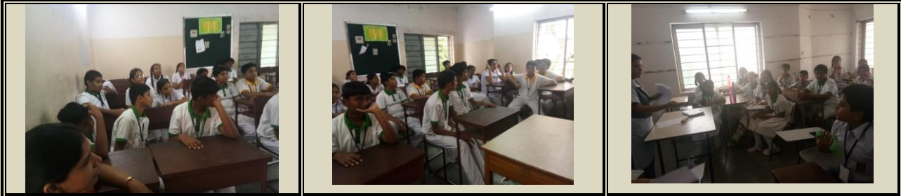
Quiz-Round 2 for students of Classes VI,VII and VIII