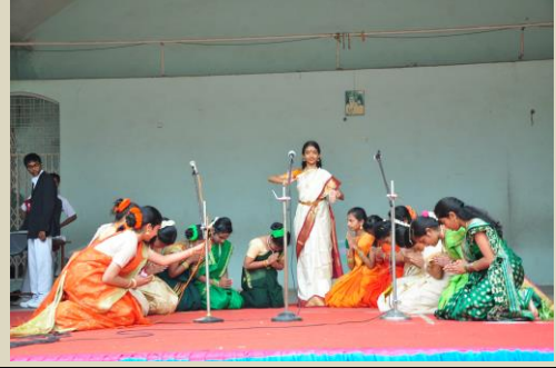
Medely of patriotic songs in different Indian languages

Six students of Class X, formed their own band, writing their own lyrics, composing their own music and showcasing these patriotic noble thoughts in front of the audience on Independence day. A telugu patriotic song and a hindi skit on “Matadaan ka mahatva- the impotence of casting your vote” was showcased to the audience.