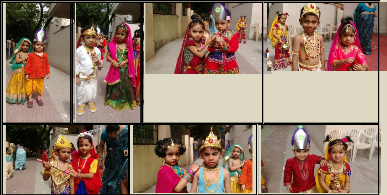
All the Kanhaiyyas with their Radhas

The birthday of Lord Krishna was celebrated in the Kindergarten wing by the presence of so many little Krishnas' and little Radhas' and little Gopikas'. The little tiny tots came dressed up in their finery, all set to break the Matkis and steal some Maakhan. They transported everyone to Vrindavan as the little Radhas paired up with little Kanhaiyyas to have a Raas-Leela.