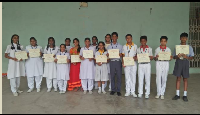
Prize winning students of the essay writing competition