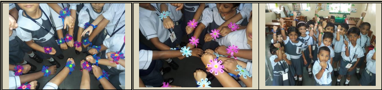
Kindergarten children celebrating Raksha Bandhan