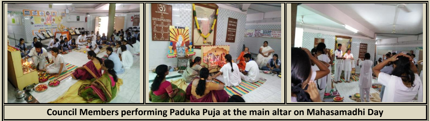
Council Members performing Paduka Puja at the main altar on Mahasamadhi Day