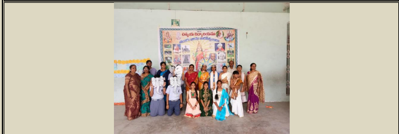
Day1 Telugu Vaarotsavalu participants with their mentors

The age old traditional rendition of a story from the mythology in the form of a song and its explanation : the Hari Katha was taken up by the students on Day2. They explained about the great poet Vemana and had little children chanting vemana shatakam padyalu on the stage.