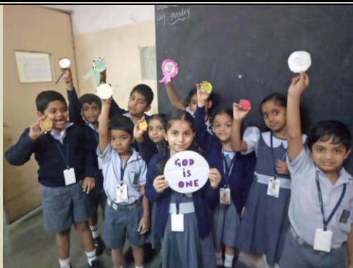
EVS activity in class II

“God is One, God is One, God is One for Everyone” – This is a Balvihar bhajan sung by little children. And how true is it!! We wish this was echoed by adults as well, just as it was done by our second graders and their EVS teachers.