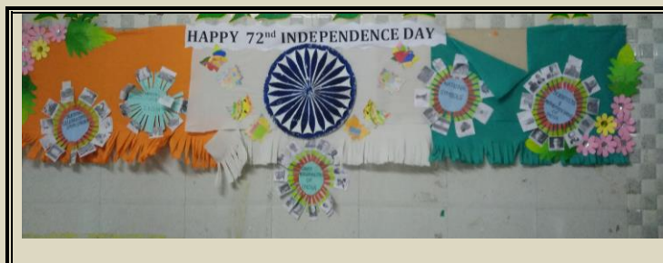
Board decoration in the ground floor lobby

The Nation’s 72 nd Independence Day was celebrated in the Vidyalaya with a lot of patriotic fervor.