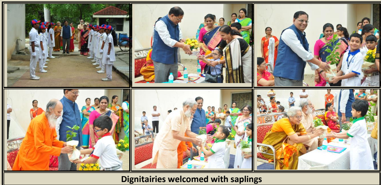
Dignitaries welcomed with saplings