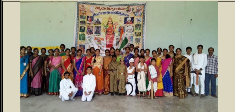
Glory of the Telugu Language

Day 4 showed the glory of the folk songs, sung for Mother nature, the nourishers - the farmers, and the protectors- the soldiers. Sweetness of the Telugu language was showcased in a dance and song sequence.