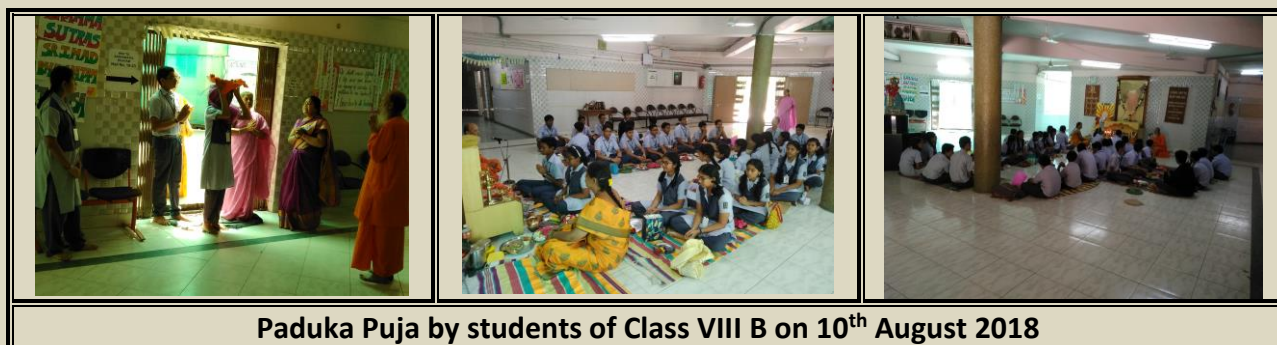
Paduka Puja by students of Class VIII B on 10 th August 2018

Paduka Puja was done by the students of Class VIIIIC on the 31 st of August 2018.